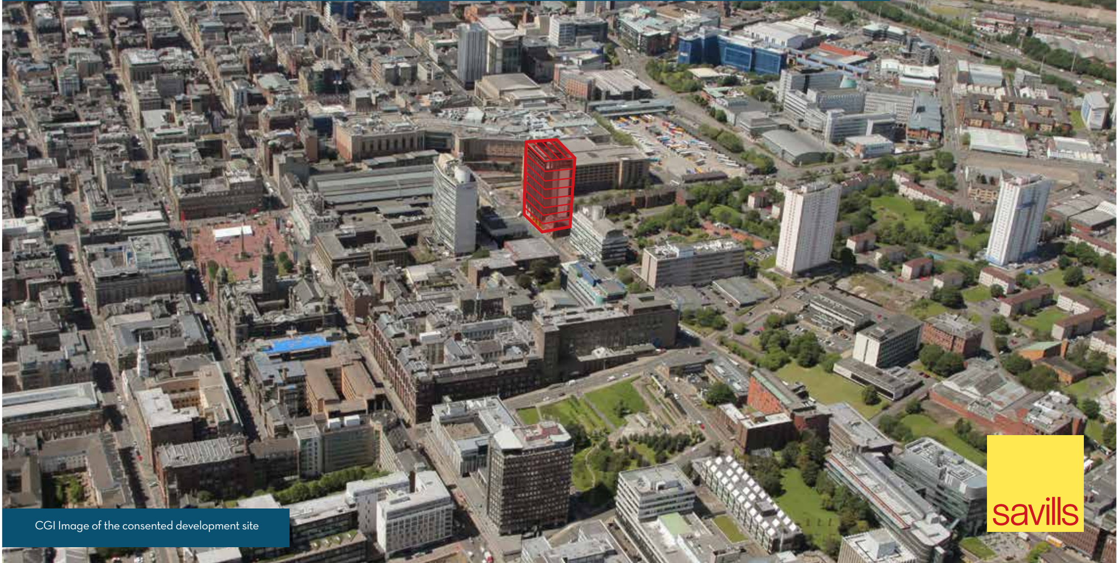
CGI Image of the consented development site